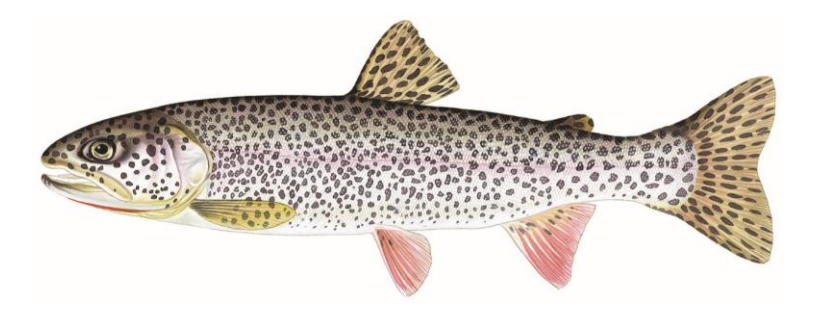
Kw'suts, Cutthroat Trout

After emerging from their eggs in the spring, Chum Salmon fry move downstream to Somenos Lake and Creek where they linger for a few weeks before heading out to the ocean in late spring. At the same, time large numbers of Chinook and Coho Salmon smolts from populations in the upper Cowichan use the Somenos basin as a staging area before their own journey to the ocean. While in the Somenos area these juvenile salmon feed and grow in preparation for their time in the ocean. The Somenos basin also provides lots of refuge areas for these juvenile salmon and trout. The main stem of the Cowichan River is a great hunting arena for Great Blue Herons, Mergansers, River Otters, and Raccoons all of which are on the lookout for young salmon. Finding juvenile salmon is a lot harder for these predators in the shaded tree canopied channels of Somenos Creek or in the relative expanse and depth of Somenos Lake.