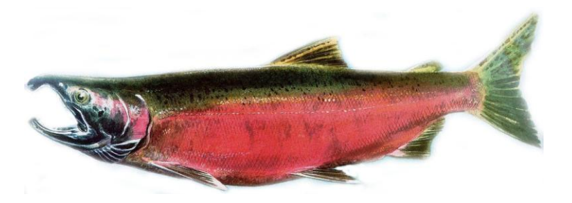
The'wun, Coho Salmon

Unfortunately, as many of you will be aware, Somenos Lake has been subjected to increasingly powerful blooms of blue-green algae during the summer. These blooms are caused by the accumulation of phosphate in the lake. This phosphate has built up over the last 150 years and can be traced back to additions from deforestation, domestic waste water, runoff from urban businesses and the extensive use of fertilisers by homeowners and farmers. The blue green algae blooms generate anoxia (absence of oxygen) in deeper waters of Somenos Lake, which used to be a summer refuge for many salmon and trout. Therefore during the summer all salmon and trout must exit Somenos Lake to find refuge in the surrounding streams and wetland channels.